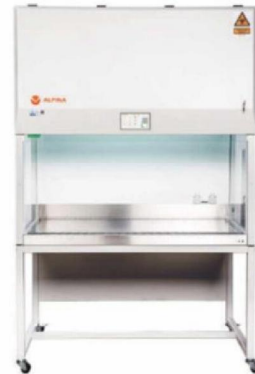
Included BSL II cabinet