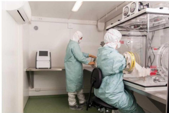
Impression Ebola test lab. Glovebox and test equipment will differ