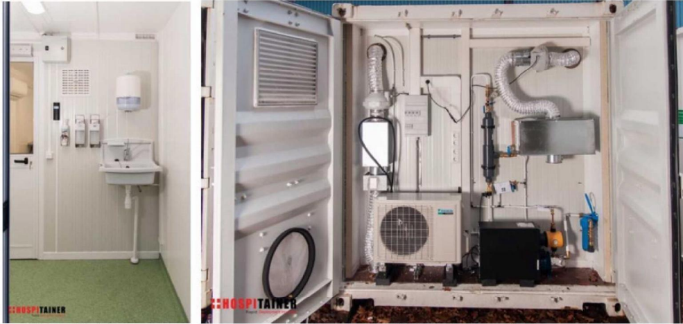
Sluice with sink