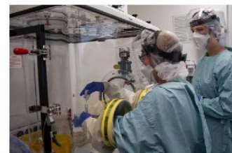
Hospitainer/Erasmus infectious disease testing for Ebola – Sierra Leone

During the Ebola crisis we delivered 11 Ebola testing labs.