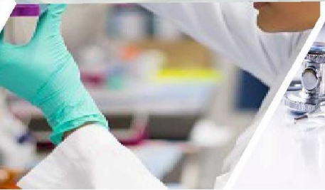
Non Registered starting materials