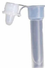
prepacked extraction buffer