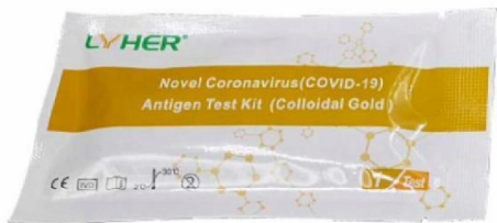
package test device