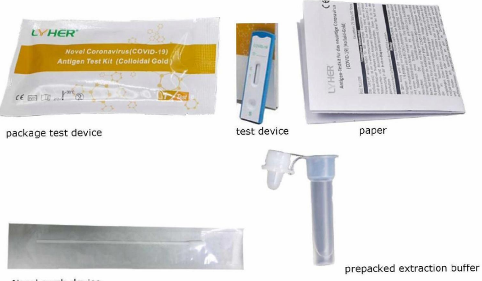
Nasal swab device