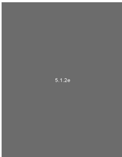
One of the 3 labs in use in Romania 2020