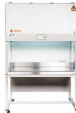
Included BSL II cabinet