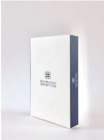
Individual Pack Box

The Edinburgh Genetics ActivXpress+ COVID-19 Antigen Complete Testing Kit comes as a box of 1, 10 or 20