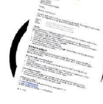
Reminder of patients