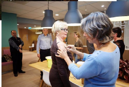
'Assembly line' vaccination