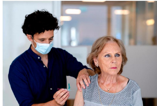
Vaccination from the back face mask