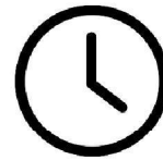
Spread of patients