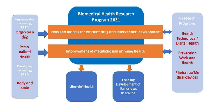
Figure 2: Program lines of research program Biomedical Health. Connection to three early research programs (Organ on a Chip, Personalized Health, Body and Brain) and strong collaboration with research programs Digital Health Technologies, Prevention, Work and Health, Photonics/medical devices. In 2021 Biomedical Health is supporting 1 shared research program (Lifestyle4Health) and new discussions with private and public partners around drug development.

In order to achieve the set goals we will develop new interventions, knowledge, tools and technology in two program lines which will be interacting with other research programs and TNO early research programs, shown in figure 2.