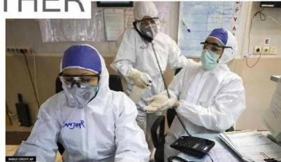
Department of Regulation and Prequalification, WHO